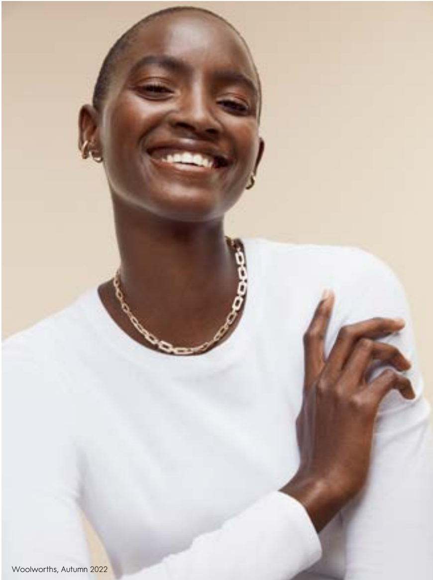
Woolworths, Autumn 2022