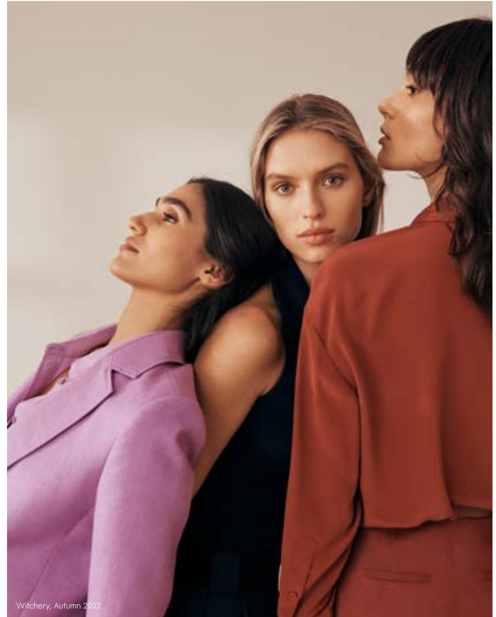
Witchery, Autumn 2022