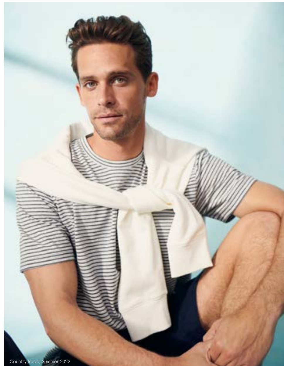
Country Road, Summer 2022

The condensed consolidated interim financial statements have not been reviewed or audited.